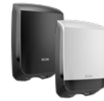
Katrin Hand Towel M Dispenser 6315568 (77434) Black 6315576 (77410) White

Hurtigopløselig papir egnet for vakuum toaletter, toaletter med mindre rørdiameter enn standard eller for lavtskyllende toaletter.